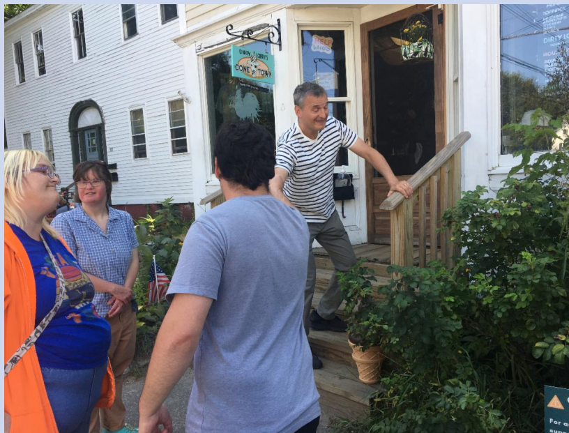
Everybody Loves Ice Cream! The day ended with yummy treats at Dirty Lorry's Cone Town , a summer service special at Dog Bar Jim on Union Street.